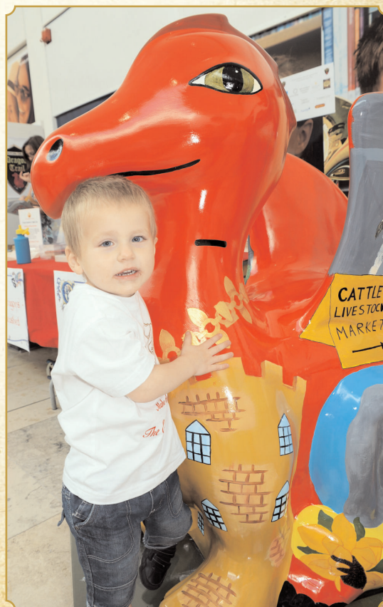
A young fan with the Mayor's Dragon.