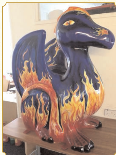
Roary - one of the finished dragons.